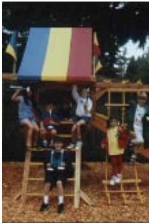
The Rocket Launch! crew

N o one is more surprised than the editor that the summer issue of SPRINGHURST QUARTERLY is coming out so late in the season. Perhaps surprised is not the right word. Considering all that has gone on around here this summer it is perhaps a wonder that this issue is here at all. Our tireless editor, who is also Springhurst's